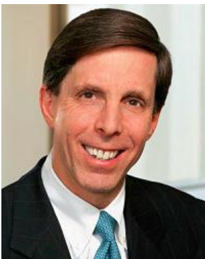
Whitney Street, Block & Leviton LLP